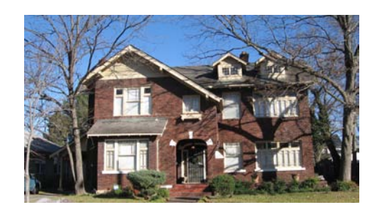
The Arkansas Rehabilitation Tax Credit would apply to contributing dwellings in National Register districts such as Central High Neighborhood (2209 S. Battery Street).