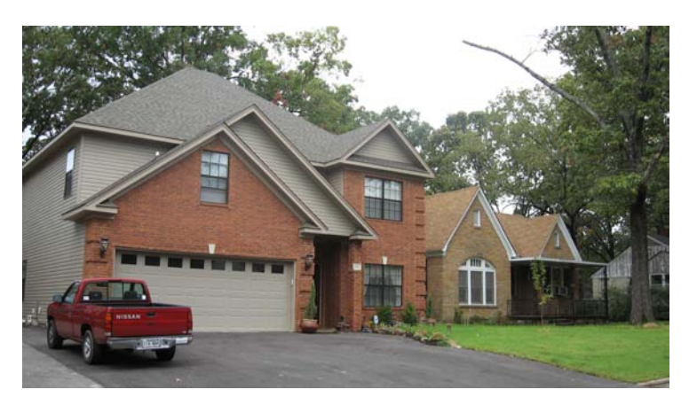
This new construction in the 1400 block of Taylor Street is out of scale and design with the adjacent dwellings in the proposed Fair Park Historic District.

The creation of protective overlays such as Design Overlay Districts or Conservation Zoning provides neighborhood residents with responsibility for future development. Standards for each DOD or Conservation Zone can be tailored to reflect the design review standards proposed by residents. The standards may be written to allow for specific approaches to building design, square footage and lot coverage. Without protective overlays, residents will lack any effective response to development or construction out of keeping with their neighborhoods.