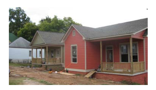
These new houses at S. Spring and W. 23<sup>rd</sup> Streets are compatible with the adjacent dwellings along the block and provide appropriate models for neighborhoods such as South End and Stephens.