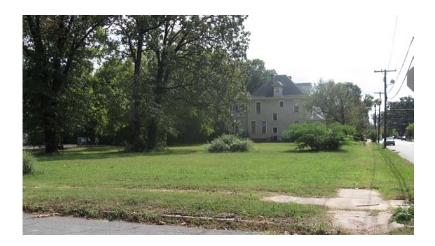
New construction on vacant lots in the Capitol Zoning District would be reviewed to ensure compatibility with adjacent buildings (22<sup>nd</sup> and Louisiana Streets).

As in the case of local ordinance historic districts, a COA is also required for work undertaken within the Capitol Zoning District. Minor modifications and some rehabilitation work may be approved on a staff level but full Commission approval is generally needed when major alterations or new buildings are proposed. Demolition of structures may not be completed without receiving a permit from the Commission.