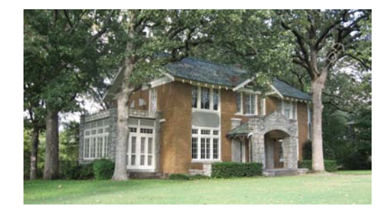
The Hillcrest Historic District has a Design Overlay District to promote compatible new construction with historic dwellings, such as at 4220 Woodlawn Drive.

A ninth DOD for the Central High School Neighborhood is presently under discussion. A map of the DOD's is located on page C.10.