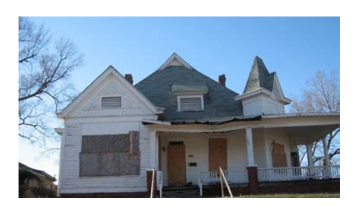
The Land Bank may be a useful tool to prevent demolition of vacant properties such as this dwelling at 1420 Booker Street.

A new city commission which holds promise for historic preservation efforts is the Little Rock Land Bank Commission (LBC). The mission of the LBC is to "reverse blight, increase home ownership and stability of property values, provide affordable housing, improve the health and safety of neighborhoods within the City, and maintain the architectural fabric of the community through the study, acquisition, and disposition of vacant, abandoned, tax delinquent, and city lien property while collaborating with citizens, neighborhoods, developers, non-profit organizations and other governmental agencies."