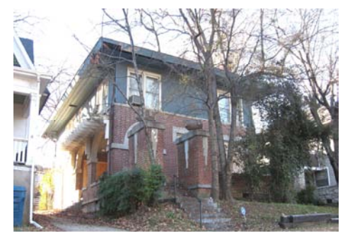
The state tax credit could also spur interest in listing areas on the National Register, such as the South End Neighborhood (2516 S. Broadway).

To qualify for the tax credit, property owners must meet the adjusted basis of the building with their rehabilitation costs. The adjusted basis of a building is the purchase price plus capital improvements minus depreciation and land value. For example, if the adjusted basis of a building is $200,000, then a minimum of $200,000 must be expended in rehabilitation costs. These costs can include professional fees and all work within the footprint of the building. The costs of additions to buildings and land-scaping generally do not qualify for the credit.