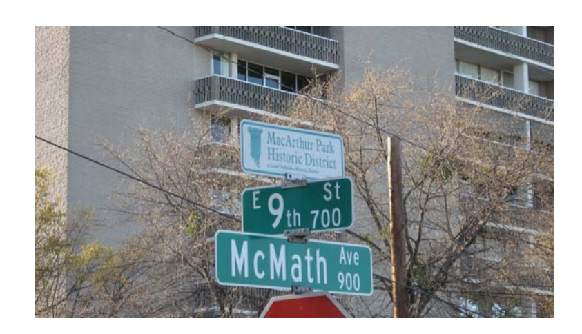
The MacArthur Park Historic District sign is an add-on to the street signs at this corner, but how readily visible is it? A free-standing sign at entrances to the district may be more effective.

One approach would be to create various designs through city efforts or through a competitive design project within the private sector. Once a logo or overall design is approved, this should be applied to directional signs, street signs, markers, and exhibits. This standardized signage should also be utilized by the Quapaw Quarter Association, River Market Design Committee and other groups who work closely with tourism initiatives. Historic District Commission review of future signage in the historic areas of the city is also recommended.