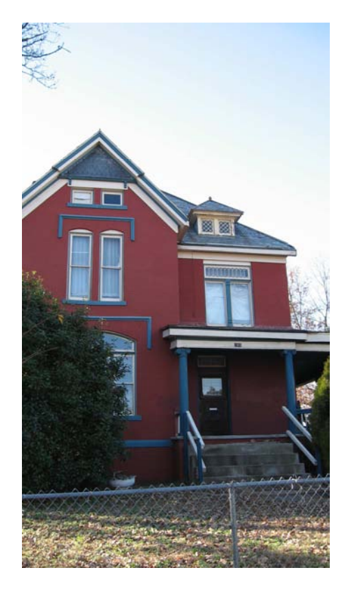
Houses rehabilitated for incomeproducing purposes could qualify for both the federal and state tax credits in National Register districts (1902 S. Schiller Street).

The Arkansas Historic Preservation Program accepts easement donations on historic properties which can be of financial benefit to property owners. An easement is a voluntary transfer of some rights of ownership. In the case of a historic preservation easement, an owner grants a government agency or qualified non-profit organization the authority to protect the historical and architectural significance of a property. In exchange, the owner gives up the right to engage in actions that would be detrimental to the property. Often this means giving up the right to demolish a historic building and replace it with a new building or development. Giving up these development rights has a dollar value which is the easement valuation afforded to the owner.