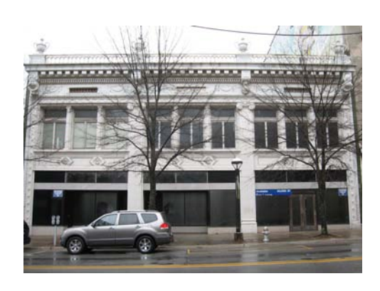
The Rose Building at 307-311 S. Main Street was an early federal tax certification project.

A number of financial incentives exist to aide and encourage business and property owners who wish to improve their downtown Little Rock properties. These include various tax advantages, as well as low-interest loan programs and other forms of financial assistance. These incentives are excellent tools that allow property owners to enhance their investments in downtown and add to the overall revitalization of the downtown area. Eligibility for these different incentives depends upon property type and other requirements.