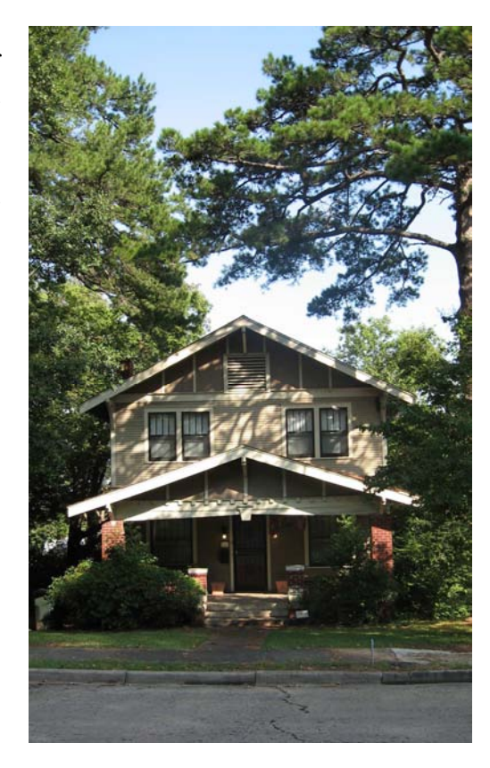
Dwellings in Little Rock's historic districts should have more flexibility in their use as home occupation businesses (129 Thayer Street).

Little Rock's Zoning Ordinance allows for home occupations under certain conditions. These conditions include no more than 49% or 500 square feet of the dwelling to be used for office space, no outside employees, and no traffic generated in greater volume than would normally be expected in a residential neighborhood. Home occupations also need to provide parking off the street. In order to increase investment and rehabilitation of Little Rock's older dwellings, these limitations should be amended. The 49% of square footage should be maintained, but the limit of 500 square feet should be removed. One employee on the premises should also be allowed. This approach to home offices is becoming increasingly common in recognition of demographic trends and the rise in self employment and outsourcing.