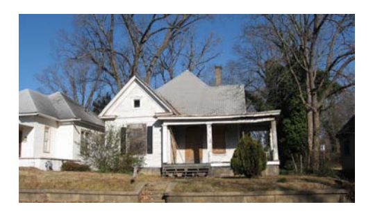
The use of Urban Homesteading and Revolving Fund programs could assist in reversing vacancy and abandonment (3412 W. 13<sup>th</sup> Street).

Successful Revolving Fund programs are found throughout the country and serve as models for Little Rock. The Providence, Rhode Island Revolving Fund is a community-based, non-profit, development and lending corporation which was established in 1980. It manages two capital funds, the Neighborhood Loan Fund with over $2 million in assets and the Downcity Loan Fund with $6.5 million. The Revolving Fund's resources are targeted to specific historic neighborhoods and primarily serve low-to-moderate income families and merchants in the Downtown Providence National Register District.