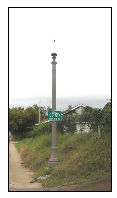
Community Development Block Grants have been used to build sidewalks and install street lights in many of Little Rock's historic districts.

The ADDI is a federally funded program designed to help low-income families make a down-payment on a home. The purchaser must be a first-time home-buyer with an income not to exceed 80% of the median income for the applicable county. The program must be used in conjunction with bond money. No repayment is required if the buyer remains in the home for five years. The amount of the down-payment shall be six percent of the sales price to a maximum amount of $10,000 for down-payment and closing costs. A house built prior to 1978 must be leadtested, must be inspected by a City Codes Inspector, and must be, before the closing, free of Codes deficiencies that are hazards to health or safety. The homebuyer is required to successfully complete an eight (8) hour housing counseling course through an approved agency. Application is made through a mortgage lender, and the process is started simply by making the offer to buy contingent upon the buyer obtaining a ADDI grant from the City of Little Rock.