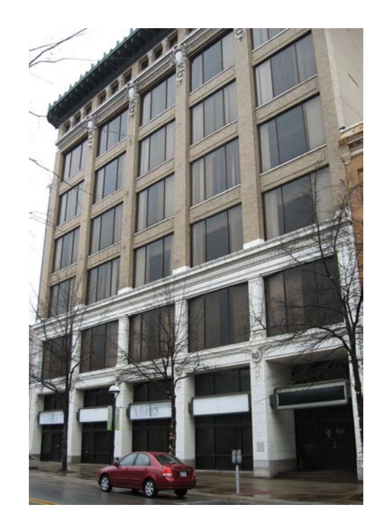
The National Register-listed Gus Blass Department Store at 320-322 S. Main Street would qualify for the federal rehabilitation tax credit.

The federal historic tax credit (HTC) has been used fairly extensively in Arkansas to support the renovation of historic housing, office, and retail space in the state. Between 2000 and 2006, the federal historic tax credit program has supported 57 projects totaling more than $54 million in renovation (in 2006 dollars). The size of projects supported by the HTC has varied from approximately $10,000 to $10 million dollars.