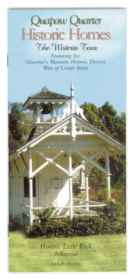
The QQA has developed excellent walking tours for the Governor's Mansion Historic District including the Mount Holly Cemetery.

Another opportunity for heritage tourism is developing walking and driving tours for the city's historic cemeteries. Mount Holly, Oakland, and Calvary cemeteries contain exceptional examples of funerary art and monuments of the 19<sup>th</sup> and early 20<sup>th</sup> centuries. In addition to their stylistic and artistic merits, these cemeteries also contain the graves of many of Little Rock's leading citizens. The development of additional tour materials for these historic sites is highly recommended. A National Register nomination for the city's historic cemeteries not currently listed is recommended for completion over the next five years.