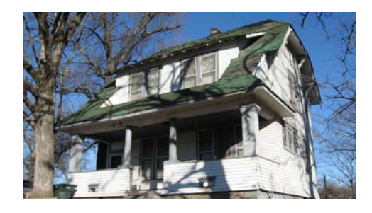
Certified Local Government Grants are available to pay for historic resource surveys and National Register nominations for areas such as South End (2901 S. State Street).

Historic Preservation Restoration Grants: Two options are available for rehabilitation of historic structures in Arkansas. Both categories of grants require a 50 percent cash match (i.e.: a $10,000 grant would require at least a $5,000 cash match). Grants of up to $10,000 are available to the owners of properties that are 1) listed on the Arkansas Register of Historic Places and/or 2) if the grant project will make the property eligible for listing on the National Register of Historic Places and the owner follows through with the National Register listing process. Grants at a minimum of $10,000 are available to the owners of properties that meet all of the following criteria: (a) listed on the National Register of Historic Places, and (b) owned by a not-forprofit organization or a municipality. This grant will not be made to individuals. Preference will be given to projects that are not eligible for other AHPP grant programs. Recipients of this grant must donate a preservation or conservation easement on the property for which the grant is awarded.