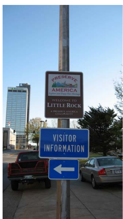
Directional signs should be standardized throughout the downtown and historic neighborhoods.