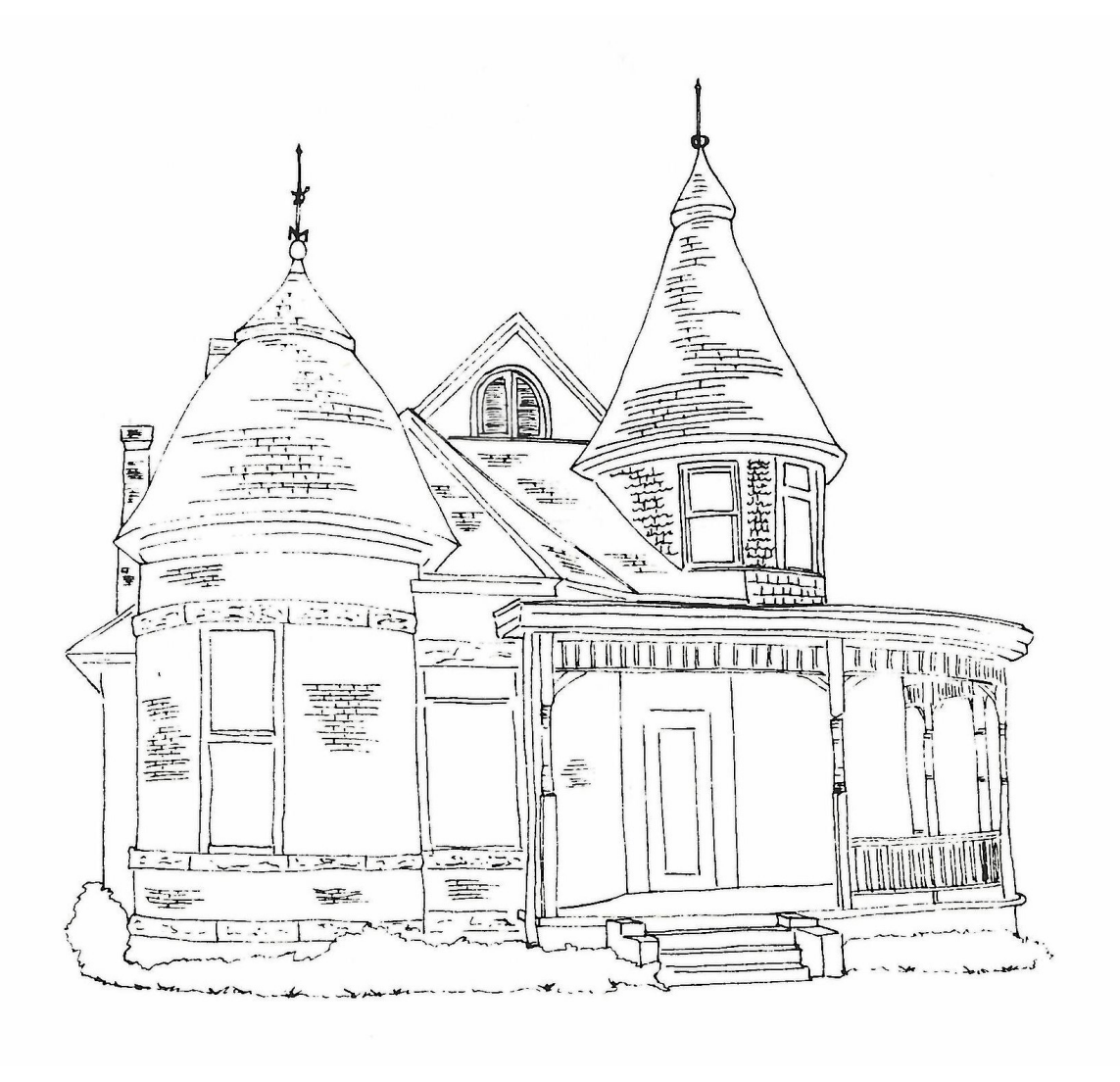
Figure 43. The Holtzman-Visonhaler-Vogler House at 512 E 9th Street is an example of Queen Anne (Victorian) style architecture. This graphic is from the 1996 edition of the Guidelines.