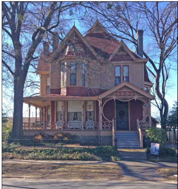
Figure 122. Hanger House, 1010 Scott Street

The Queen Anne, or Victorian, style was popularized in the late 19 th Century and featured an asymmetrical floor plan with extensive exterior detailing, including various building materials, textures, and colors. This eclectic style, combining medieval and classical elements, was generally two-stories high and often had corner towers, turrets or projecting bays. Exterior wall surfaces were often rich mixtures of brick, wood, stone, and wood shingles cut in various patterns. Large wraparound porches with milled trim—columns, brackets, balusters, and fretwork—were usually present on the main façade. Porches were stacked on top of porches. For the first time, the upper and lower window sashes had different number of lights. Frequently, the upper sash was bordered with small colored panes. Entire windows might be leaded stained glass. Huge medieval-style chimneys towered over the steeply pitched roof, which was frequently surfaced in decorative slate or standing-seam metal. Gables included decorative verge boards and other trim. Smooth, plain surfaces were avoided.