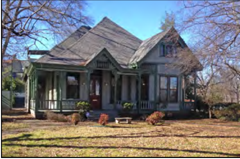
Figure 120. Bein House, 1302 Cumberland Street