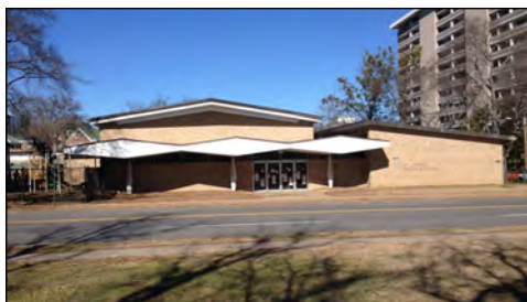
Figure 162. St. Edwards School, 815 e 9th Street