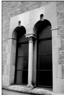
Figure 138. YMCA Building,