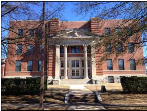
Figure 132. East Side School 1401 Scott Street