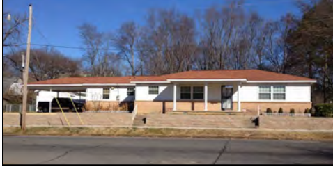
Figure 159 House, 420 E 11th Street