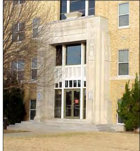
Figure 158. UALR William H Bowen School of Law, 1201 McMath