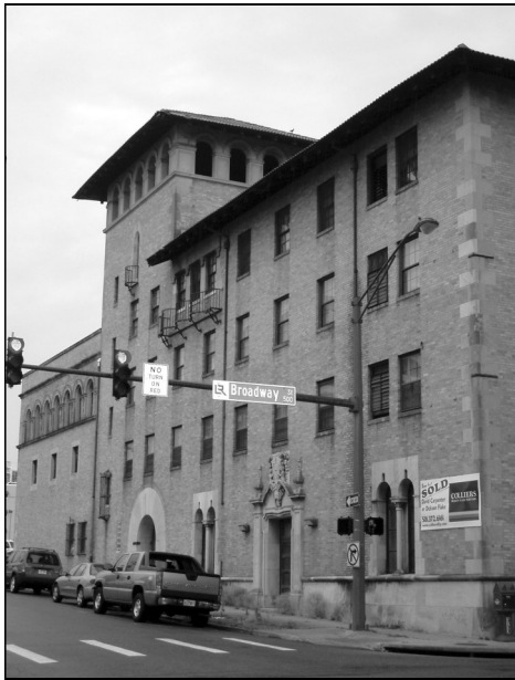
Figure 137. YMCA Building , 520 South Broadway