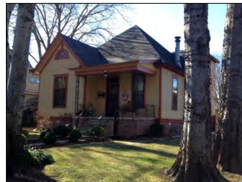
Figure 130. Hanggi House, 1314 Cumberland Street