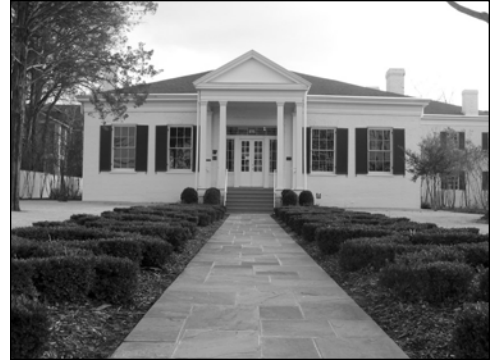
Figure 109. Curran Hall, 615 E. Capital Avenue.