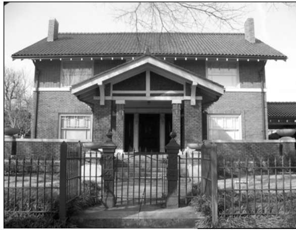
Figure 154. 2200 Broadway