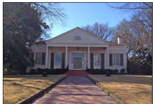
Figure 111. Trapnall Hall, 423 E. Capital Avenue