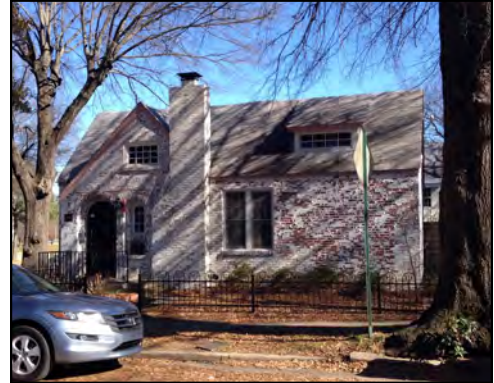
Figure 133. 1301 Cumberland Street