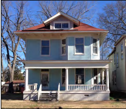
Figure 143. Fletcher House at 909 Cumberland Street