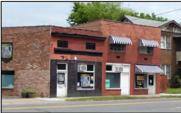
Figure 167. Baker's Liquor, 400-406 E. Ninth Street