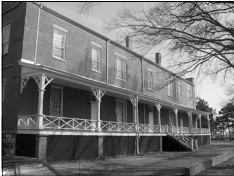
Figure 107 The Arsenal Building (south elevation)