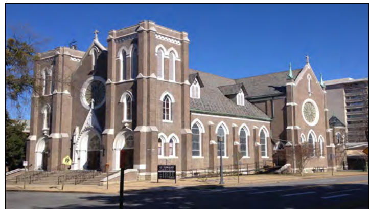
Figure 113. St. Edward’s Church, 815 Sherman