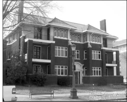
Fig. 146. Rainwater Apartments. 519 E. Capitol