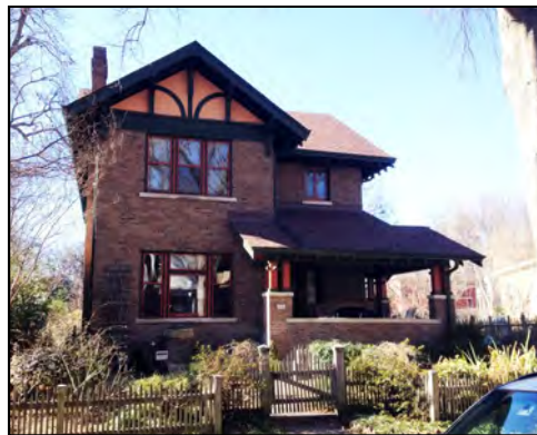
Figure 151. Baer House, 1010 Rock Street