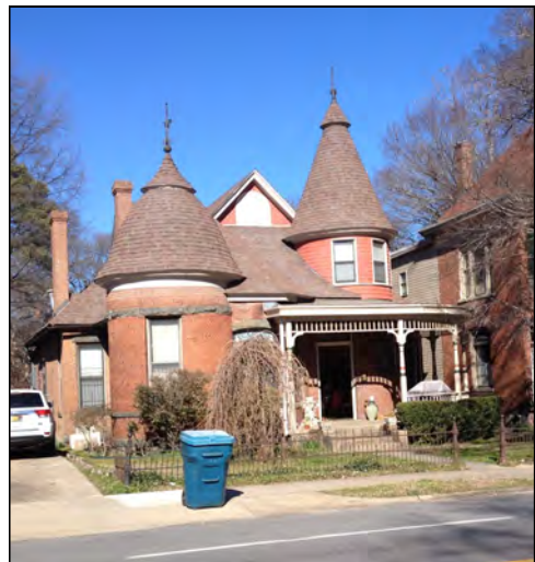
Figure 124. Holtzman-Vinsonhaler-Vogler House 512 E. 9th Street