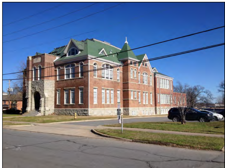
Figure 127. Kramer School, 701 Sherman Street