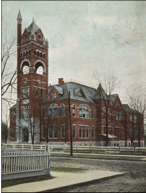
Figure 126. Historic photo of Kramer School courtesy of the Butler Center for Arkansas Studies, Central Arkansas Library System.