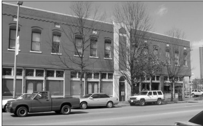
Figure 165. 1200 S. Main Street