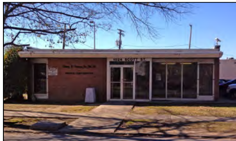
Figure 161. Oden Optical Company, 112 E 11th Street