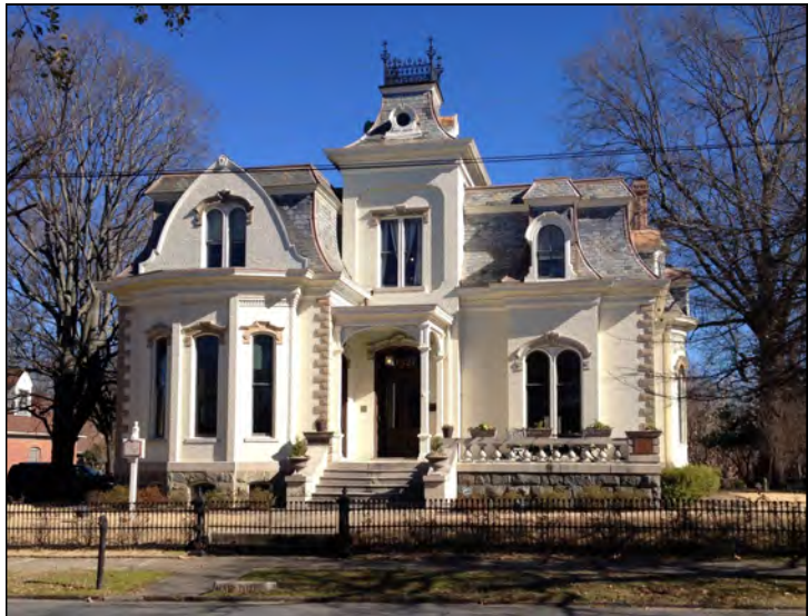
Figure 117. Villa Marré, 1321 Scott Street