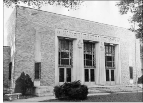
Figure 157. Fine Arts Museum, 510 E. Ninth ca. 1937