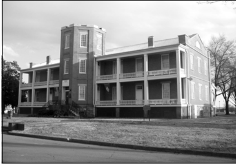
Figure 106 The Arsenal Building, MacArthur Park 503 E. 9th