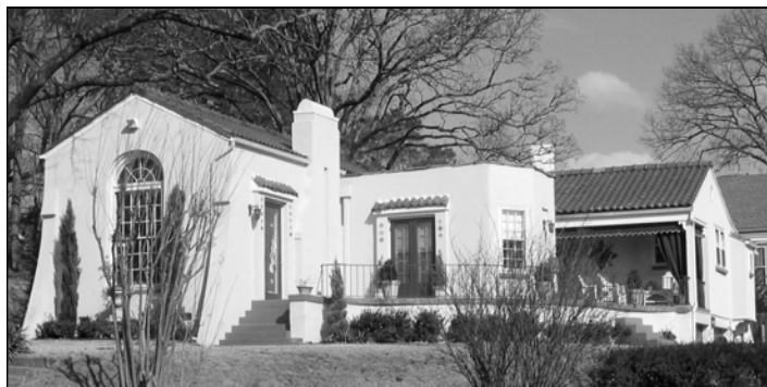
Figure 140. 3233 Ozark Street