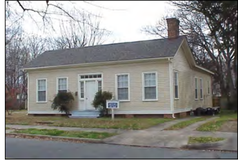
Figure 163. 1st Kadel Cottage, 407 E. 10th Street