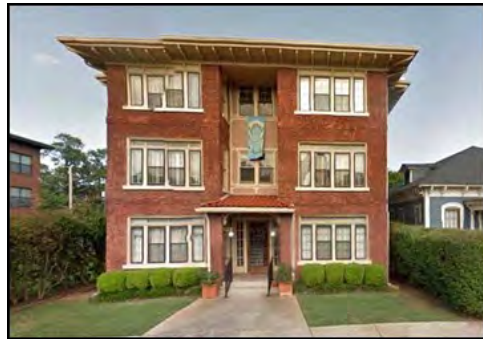
Figure 150. 511 Rock Street