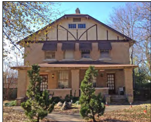
Figure 148. 1412-1414 Scott Street