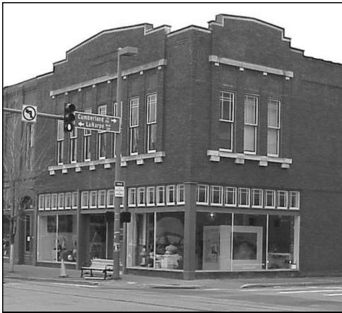
Figure 164. 301 E. President Clinton Ave.