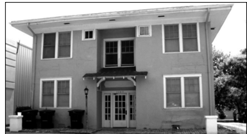
Figure 147. 1107 Cumberland Street