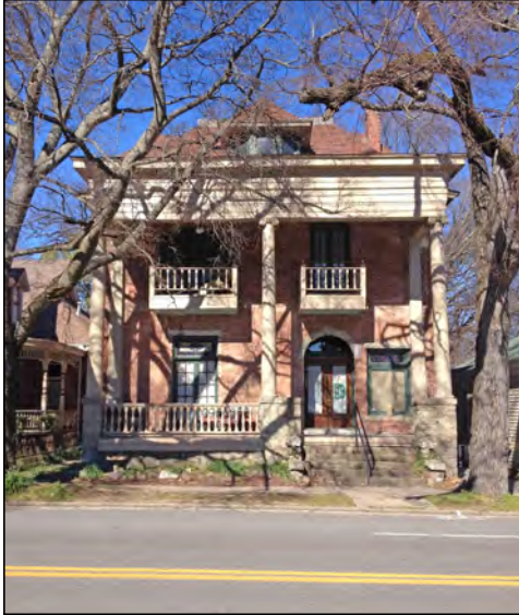
Figure 131. Holtzman House #2, 514 E. 9th Street