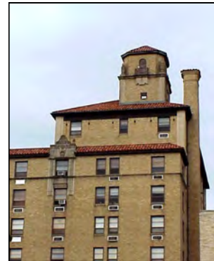
Figure 139. Albert Pike Hotel, 701 Scott Street