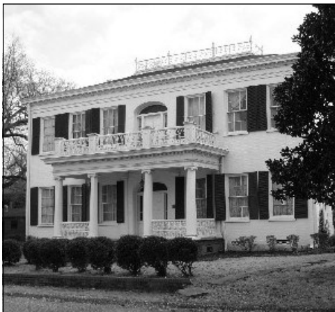
Figure 108. Absalom Fowler House, 503 E. 6 th Street