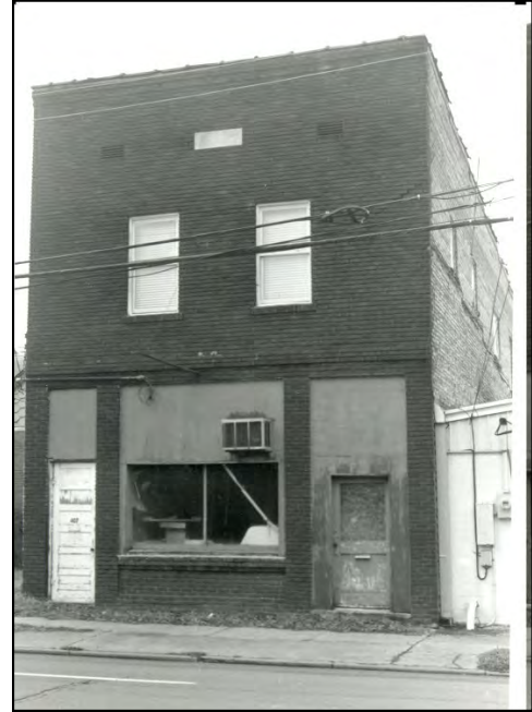
Figure 166. Kindervater Building, 407 E Ninth Street