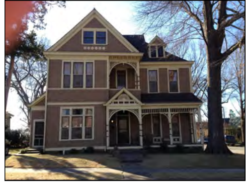
Figure 123. Ferling House Apartments 401-403 E 10th Street