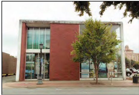
Figure 156. Paragon Building at 307 E Capitol Avenue