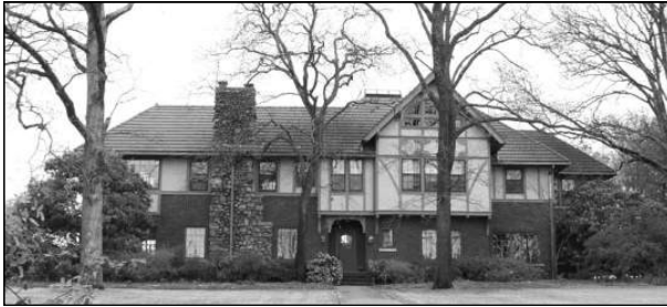
Figure 134. 3420 Hill Road