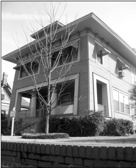
Fig. 141. Fordyce House