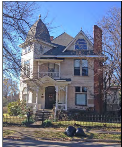
Figure 119. Chisum House, 1320 Cumberland Street