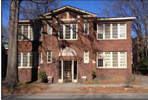
Figure 149. Beverly Apartments, 406 E 7th Street