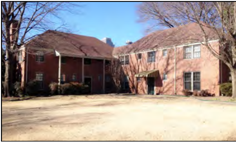
Figure 160. Phillips Apartments, 922 Cumberland Street