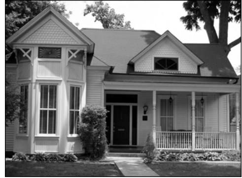
Figure 118. Butler House, 609 Rock