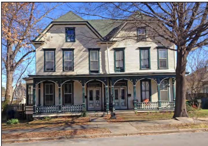
Figure 125. Gemmil House, 1415-1417 Cumberland Street