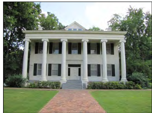
Figure 110. Pike Fletcher Terry House, 411 E 7th