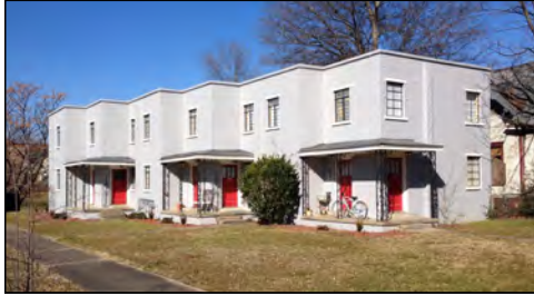
Figure 155. Apartments at 418-422 15th Street