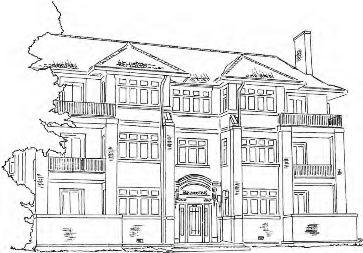
Figure 168. The Rainwater Apartments at 519 E Capitol Avenue are an example of Craftsman style architecture. This graphic is from the 1996 edition of the Guidelines.