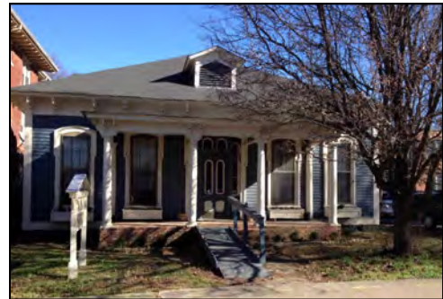
Figure 115. Samuels-Narkinski House, 515 Rock