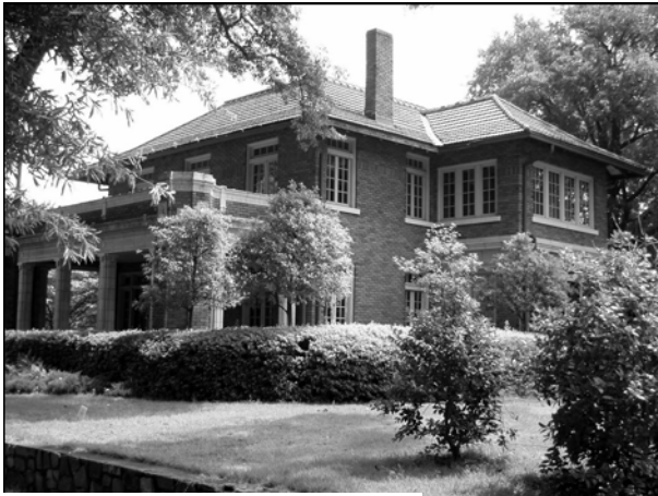
Figure 153. 1701 South Broadway