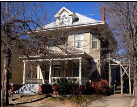
Figure 145. Johnson House #1, 518 E. 8th Street