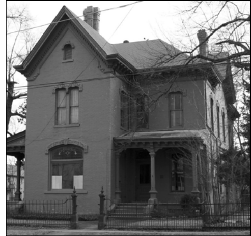
Figure 114. Mills House, 523 E. 6th