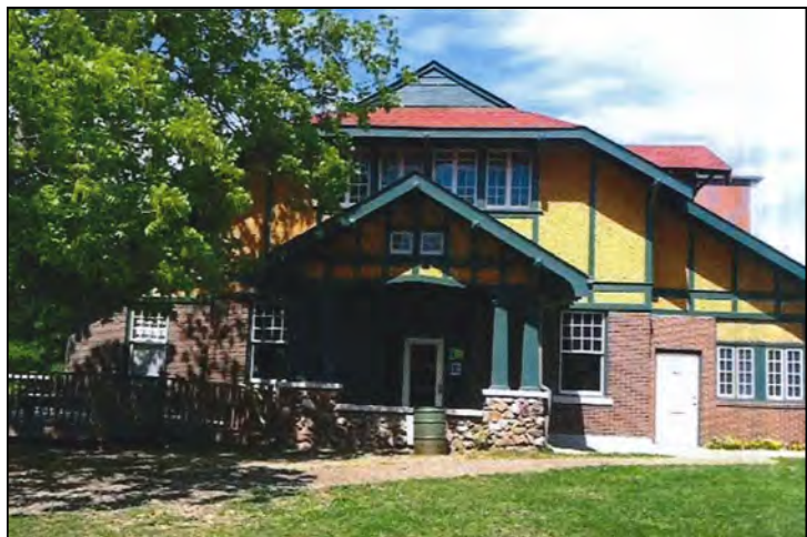
Figure 152. Old Fire Station #2, 1201 Commerce Street