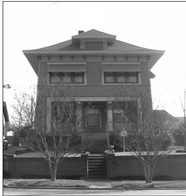
Figure 142. Fordyce House, 2115 South Broadway