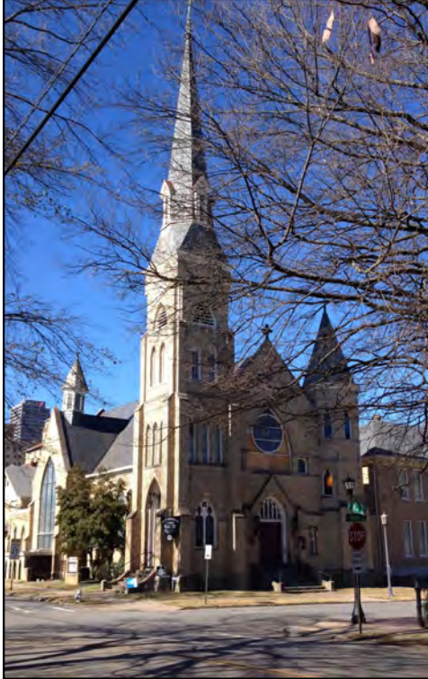
Figure 112. First Lutheran Church, 314 E 8th Street