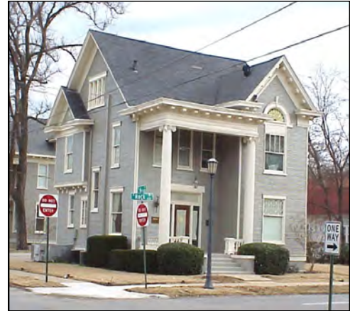
Figure 128. 601 Rock Street