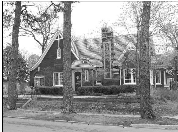
Figure 136. 4220 Woodlawn