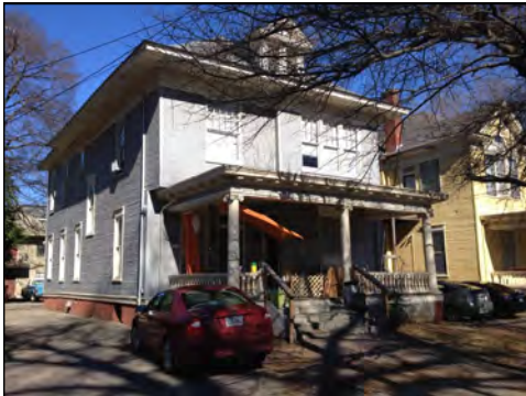
Figure 144. Johnson House #3, 514 E. 8th Street