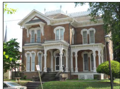
Figure 116. Lincoln House, 301 E. 7th Street