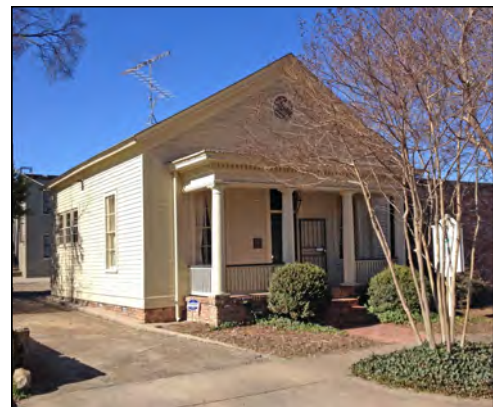
Figure 129. Reigler Cottage, 610 Rock Street