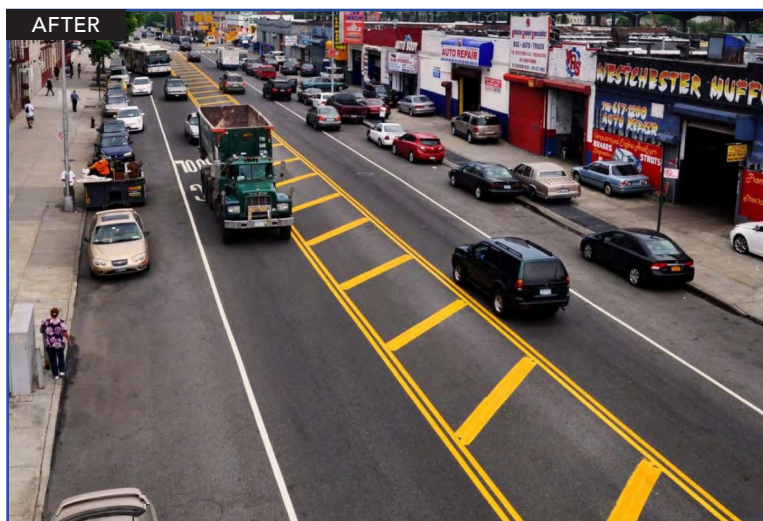
Before and after Road Diet on Southern Blvd., Bronx, NY.