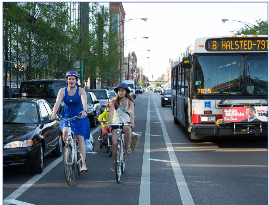
Road Diets can facilitate safe transportation for all modes.

Commuter bicycle ridership increased by 49% in the morning and 62.5% in the afternoon after installation of a barrier and protected bike lane