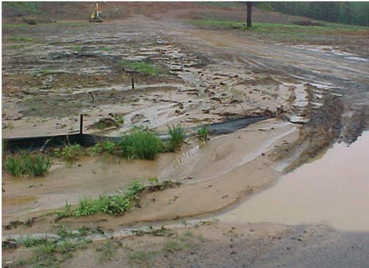
Uncontrolled storm water run off from a construction site.

Storm water run-off from construction sites can have a significant impact on Little Rock's water quality. Sediment is the number one pollutant of streams in the nation. As storm water flows over a construction site, it picks up pollutants like sediment, debris and chemicals. These pollutants and sediment can have profound long term effects on the quality of our streams and rivers.