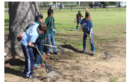
We welcomed 70+ youth to MacArthur Park to help us clean the playground March 16th. Thank you kids!