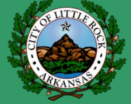
2013-2015 BOND AND SALES TAX PROJECTS 2014 YEAR END - WARD 6