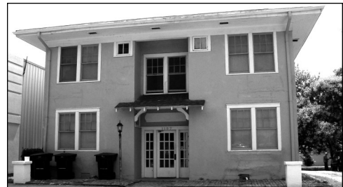
Figure 147. 1107 Cumberland Street