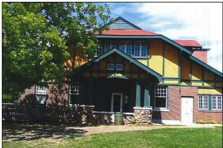
Figure 152. Old Fire Station #2, 1201 Commerce Street