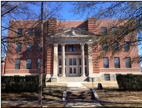
Figure 132. East Side School 1401 Scott Street