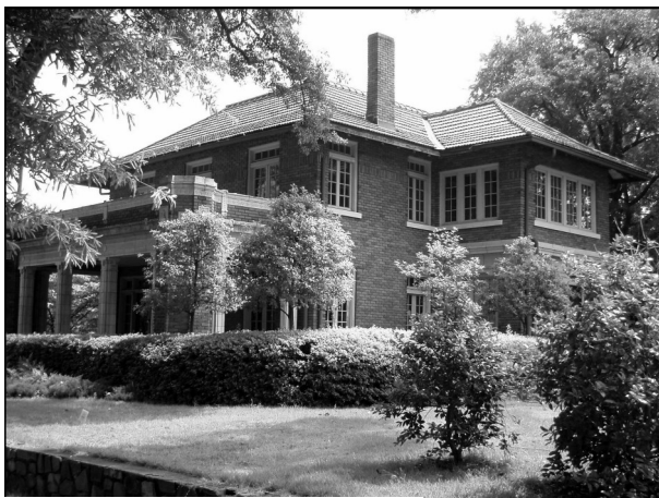
Figure 153. 1701 South Broadway