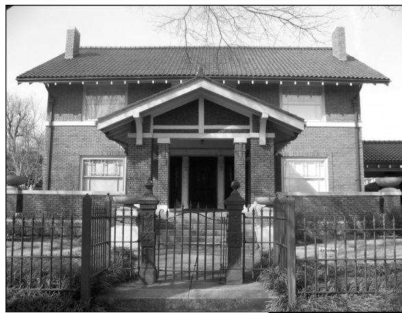
Figure 154. 2200 Broadway