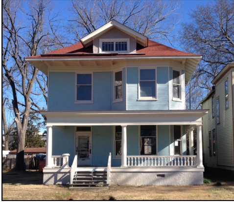
Figure 143. Fletcher House at 909 Cumberland Street