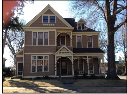
Figure 123. Ferling House Apartments 401-403 E 10th Street