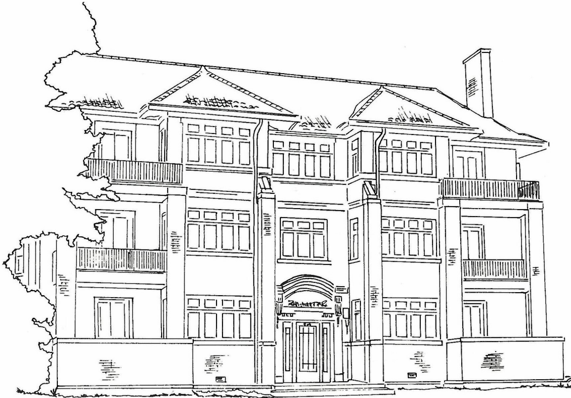
Figure 168. The Rainwater Apartments at 519 E Capitol Avenue are an example of Craftsman style architecture. This graphic is from the 1996 edition of the Guidelines.