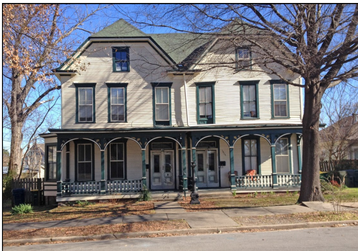
Figure 125. Gemmil House, 1415-1417 Cumberland Street