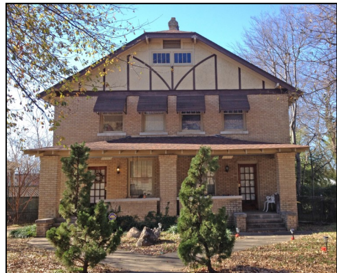
Figure 148. 1412-1414 Scott Street