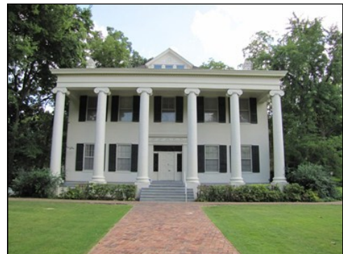
Figure 110. Pike Fletcher Terry House, 411 E 7th