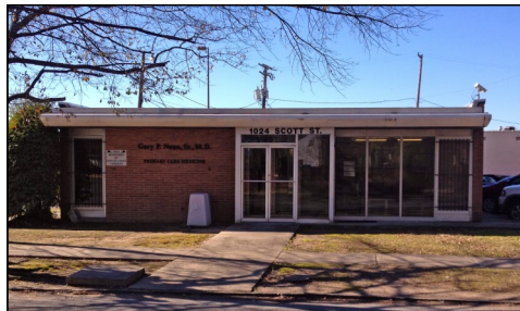
Figure 161. Oden Optical Company, 112 E 11th Street