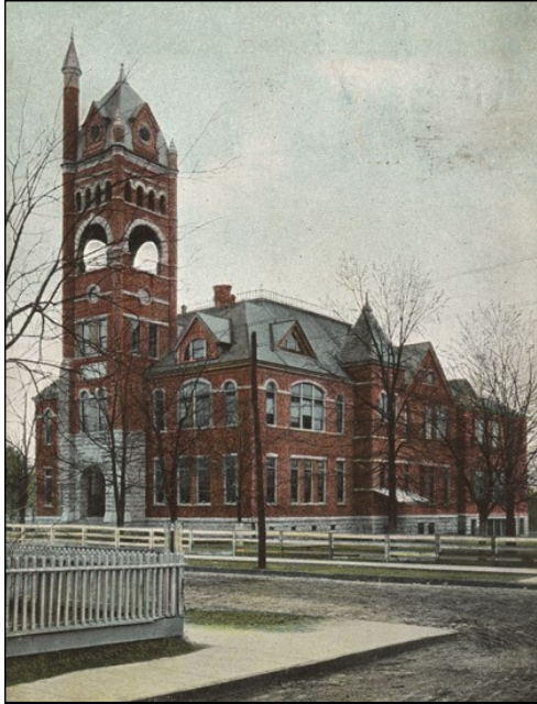
Figure 126. Historic photo of Kramer School courtesy of the Butler Center for Arkansas Studies, Central Arkansas Library System.