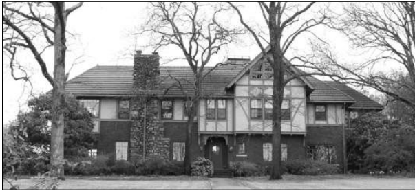
Figure 134. 3420 Hill Road