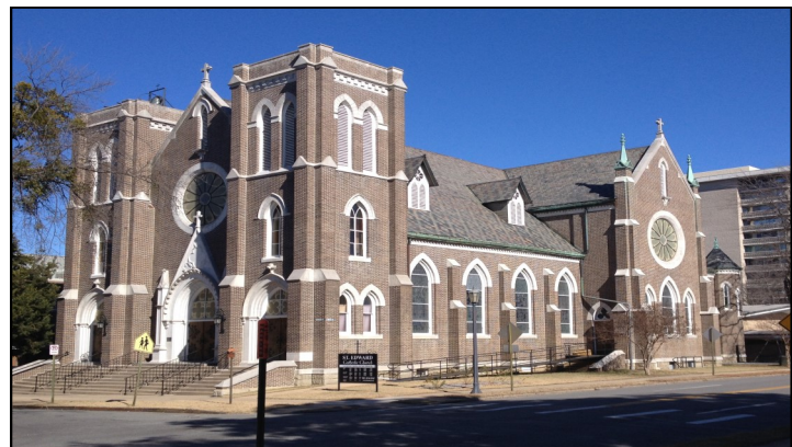
Figure 113. St. Edward’s Church, 815 Sherman