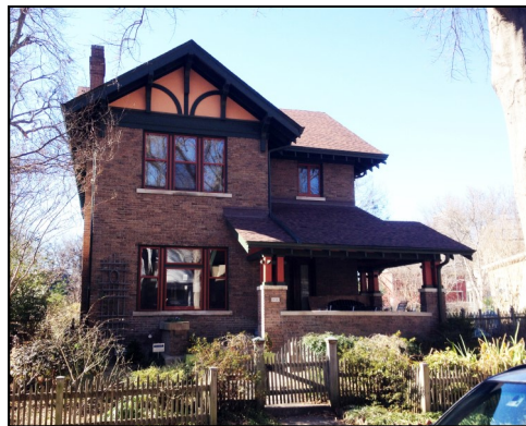
Figure 151. Baer House, 1010 Rock Street