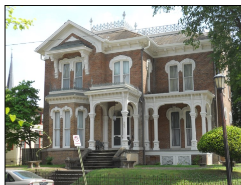
Figure 116. Lincoln House, 301 E. 7th