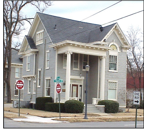
Figure 128. 601 Rock Street