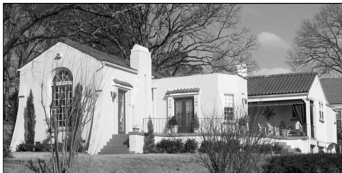
Figure 140. 3233 Ozark Street