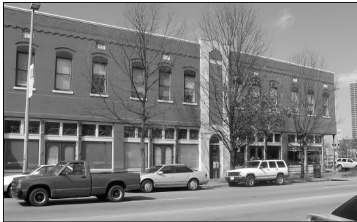
Figure 165. 1200 S. Main Street