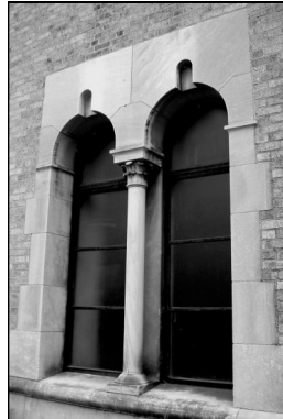
Figure 138. YMCA Building,