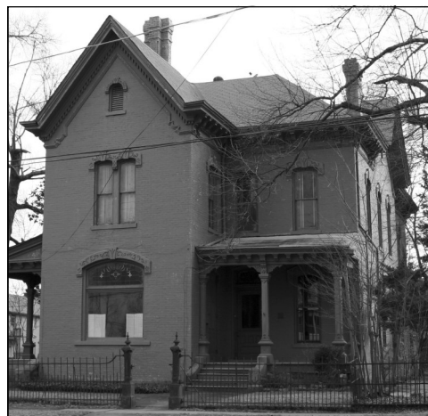
Figure 114. Mills House, 523 E. 6th