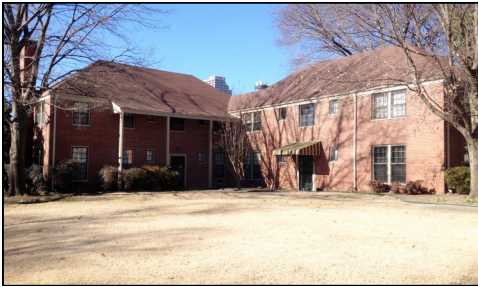
Figure 160. Phillips Apartments, 922 Cumberland Street