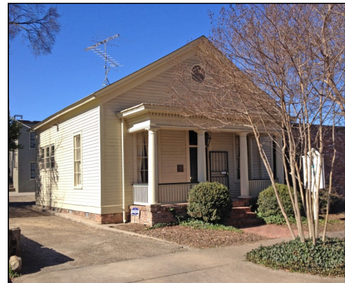
Figure 129. Reigler Cottage, 610 Rock Street