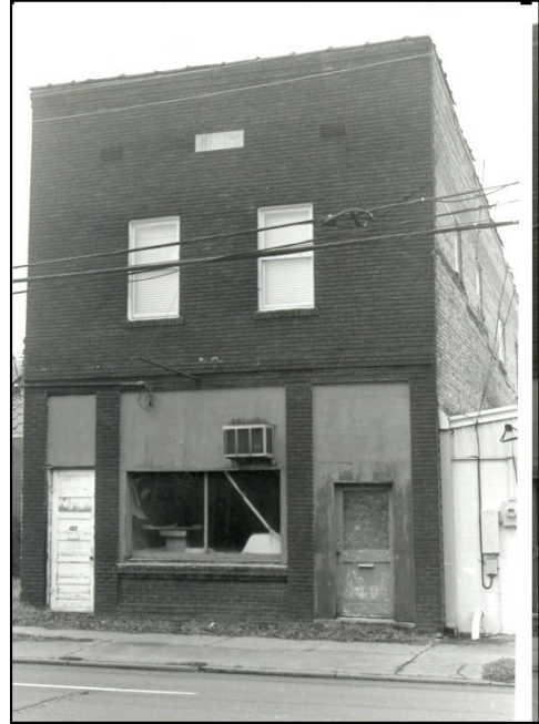
Figure 166. Kindervater Building, 407 E Ninth Street