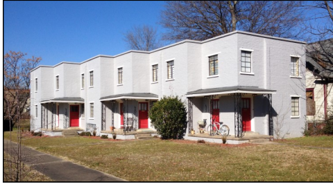
Figure 155. Apartments at 418-422 15th Street