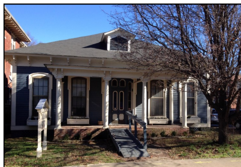
Figure 115. Samuels-Narkinski House, 515 Rock