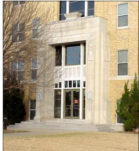
Figure 158. UALR William H Bowen School of Law, 1201 McMath