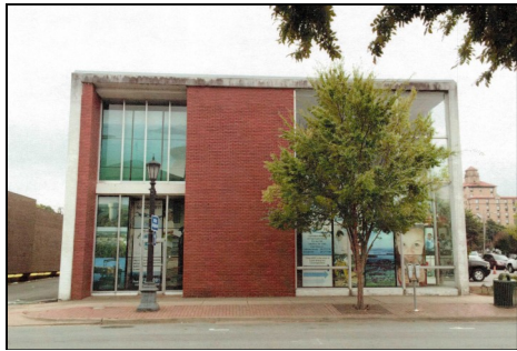
Figure 156. Paragon Building at 307 E Capitol Avenue