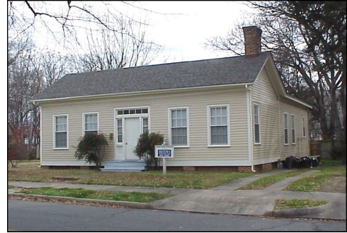
Figure 163. 1st Kadel Cottage, 407 E. 10th Street