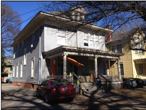
Figure 144. Johnson House #3, 514 E. 8th Street