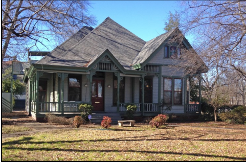
Figure 120. Bein House, 1302 Cumberland Street