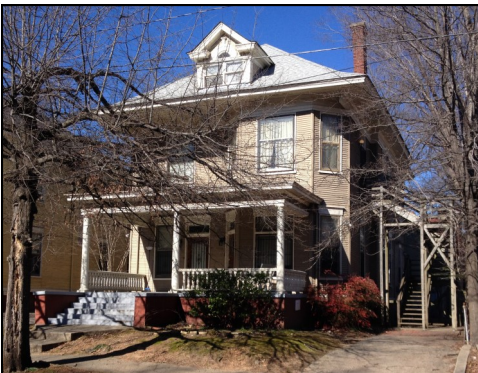
Figure 145. Johnson House #1, 518 E. 8th Street