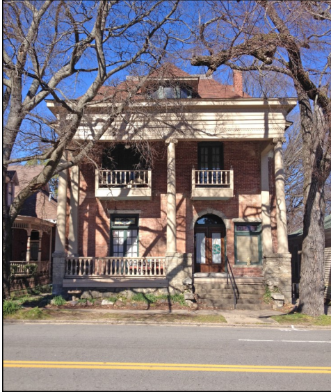
Figure 131. Holtzman House #2, 514 E. 9th Street