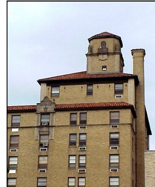
Figure 139. Albert Pike Hotel, 701 Scott Street