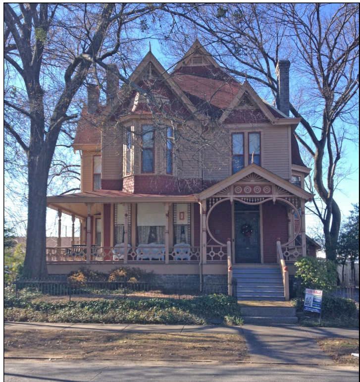
Figure 122. Hanger House, 1010 Scott Street

This exuberant style championed individualism and fanciful detail, made possible by the new industrial