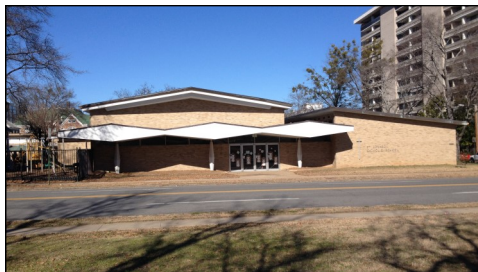
Figure 162. St. Edwards School, 815 e 9th Street