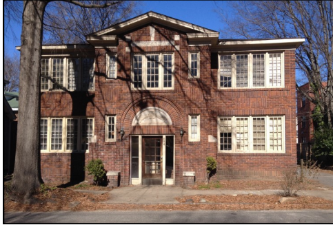
Figure 149. Beverly Apartments, 406 E 7th Street