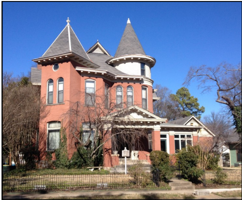
Figure 121. Holtzman-Vinsonhaler House, 500 E. 9th Street