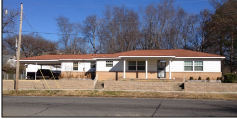
Figure 159 House, 420 E 11th Street