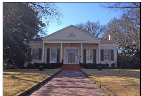
Figure 111. Trapnall Hall, 423 E. Capital Avenue