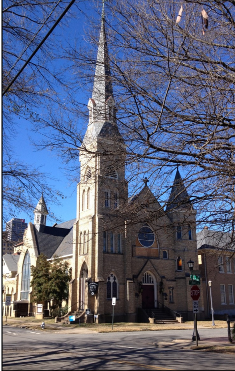
Figure 112. First Lutheran Church, 314 E 8th Street