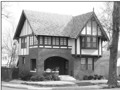
Figure 135. 324 W. Daisy Bates Drive