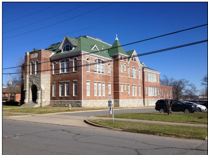
Figure 127. Kramer School, 701 Sherman Street