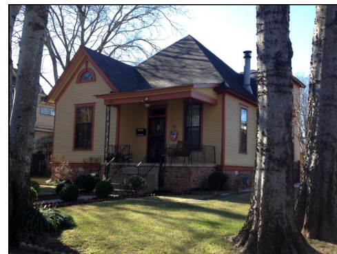
Figure 130. Hanggi House, 1314 Cumberland Street