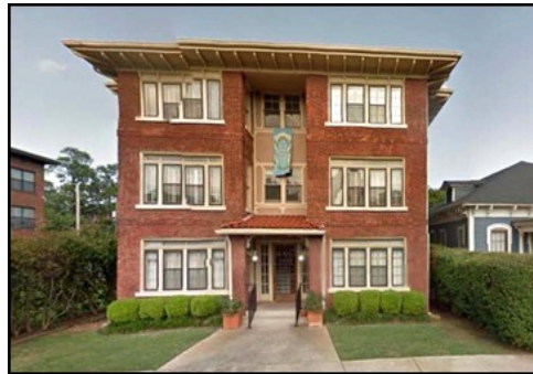
Figure 150. 511 Rock Street