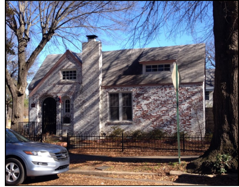
Figure 133. 1301 Cumberland Street