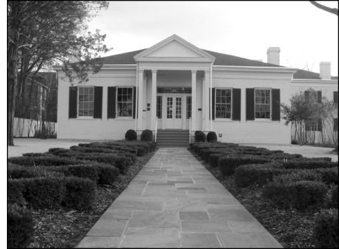
Figure 109. Curran Hall, 615 E. Capital Avenue.