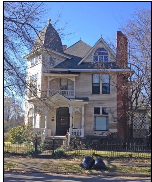
Figure 119. Chisum House, 1320 Cumberland Street