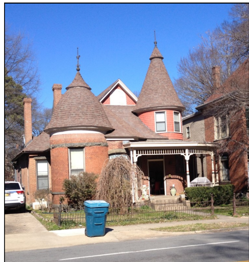
Figure 124. Holtzman-Vinsonhaler-Vogler House 512 E. 9th Street