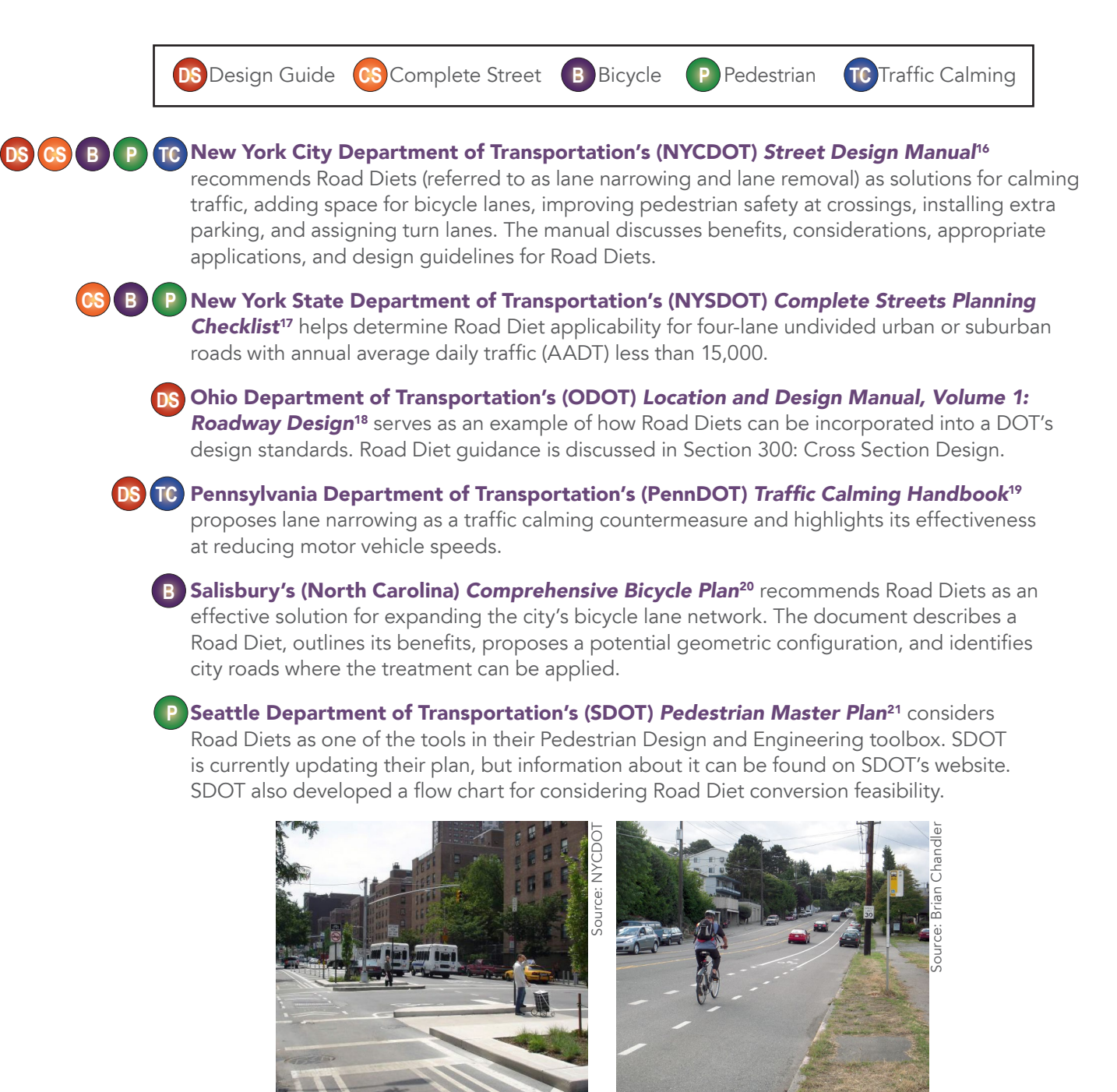
Road Diet on Ninth Avenue, Manhattan, NY.