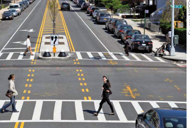
Road Diet on West Sixth Street, Brooklyn, NY.

B P Minnesota Department of Transportation's (MnDOT) Best Practices for Pedestrian-Bicycle Safety (2013)<sup>15</sup> presents Road Diets as a solution to improve safety for pedestrians and bicyclists on roadways and stresses the treatment's ability to lower crash rates for all users. The document provides Road Dietrelated guidance about ADT, typical construction costs, associated crash reduction rates, and common design features.