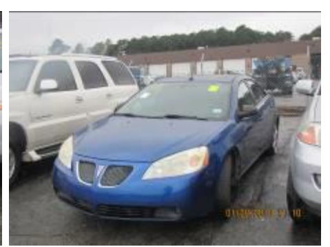
2002 CADILLAC ESCALDE CREAM MILEAGE UNKNOWN