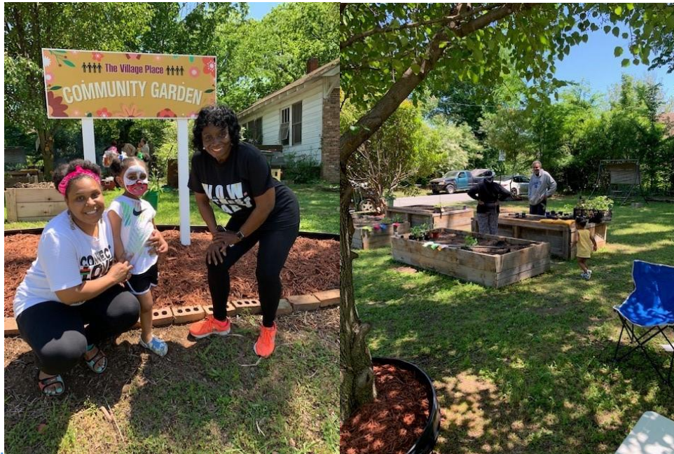
Pictured: The Land Bank donated property to the Village Place, LLC for a community garden, the cleanup and ground breaking ceremony was May 8 th

The mission of the Little Rock Land Bank Commission is to reverse blight, increase home ownership and stability of property values, provide affordable housing, improve the health and safety of neighborhoods within the City of Little Rock, and maintain the architectural fabric of the community through the study, acquisition, and disposition of vacant, abandoned, tax delinquent, and City lien property while collaborating with citizens, neighborhoods, developers, nonprofit organizations and other governmental agencies. The Land Bank currently has 45 available properties for sale. Meetings are held every third Wednesday of each month at the Willie Hinton