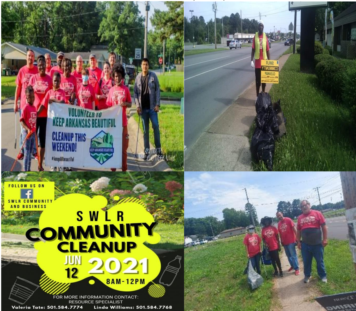
Pictured: Southwest Community Cleanup on June 12, 2021.

City Hall and Neighborhood Resource Centers reopened to the Public: June 01, 2021