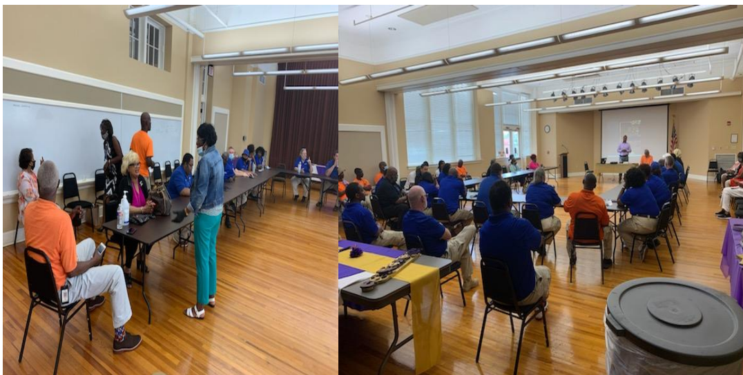
Pictured: Celebration attendees.