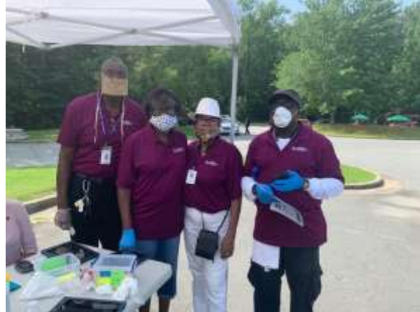
First Annual Drive Thru Maze of Horror Event held at West Central Community Center October 31, 2020